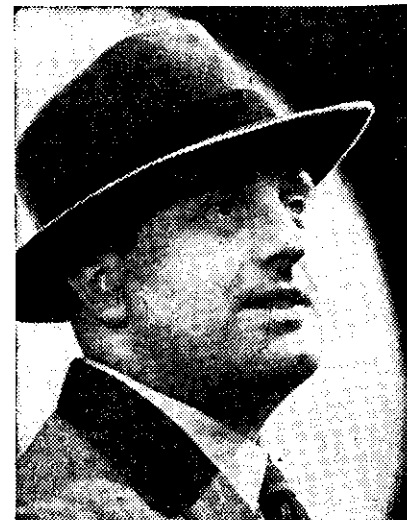
The English tenor WALTER MIDGLEY, who will be heard in a studio recital from 2XN Nelson at 9.4 p.m. on Tuesday, April 26