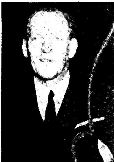
PRINCE AXEL OF DENMARK