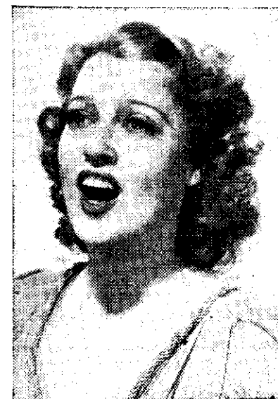
JEANETTE MacDONALD (soprano), who will be Station 4YA's "Morning Star" at 11.30 a.m. on Tuesday, February 22