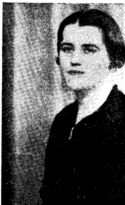
JOAN HAMMOND (soprano) will be heard in 2XN's Grand Opera programme starting at 8.43 p.m. on Friday, February 25

A product of E. C. De Witt & Co. (N.Z.) Ltd., 9 Herbert Street, Wellington, New Zealand.