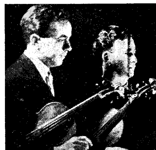
HAYDN'S "QUARTET IN C" will be played from 3YC at 9.44 p.m. on Tuesday