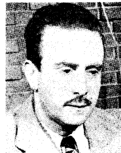
CLAUDIO ARRAU, pianist, who will be heard from 3YZ at 9.58 p.m. on Monday, February 21