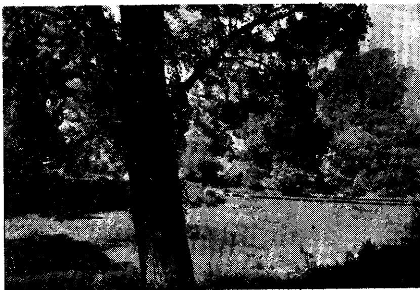
FROM this pleasantly sheltered corner of the Napier Botanical Gardens, 2YZ will broadcast its "Carols by Candlelight" session at 10.0 p.m. on Christmas Eve. The combined choirs of Napier and Hastings will take part, assisted by the Napier Citizens' Band

Protect yourself from sun, wind, salt water . . .