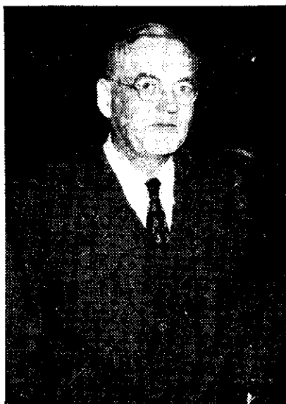
JOHN FOSTER DULLES "Secular policies . . . ."