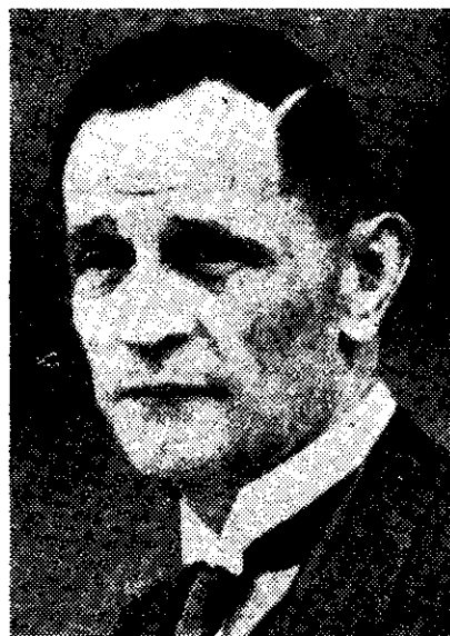
MARTIN NIEMOELLER ". . . in divine perspective"