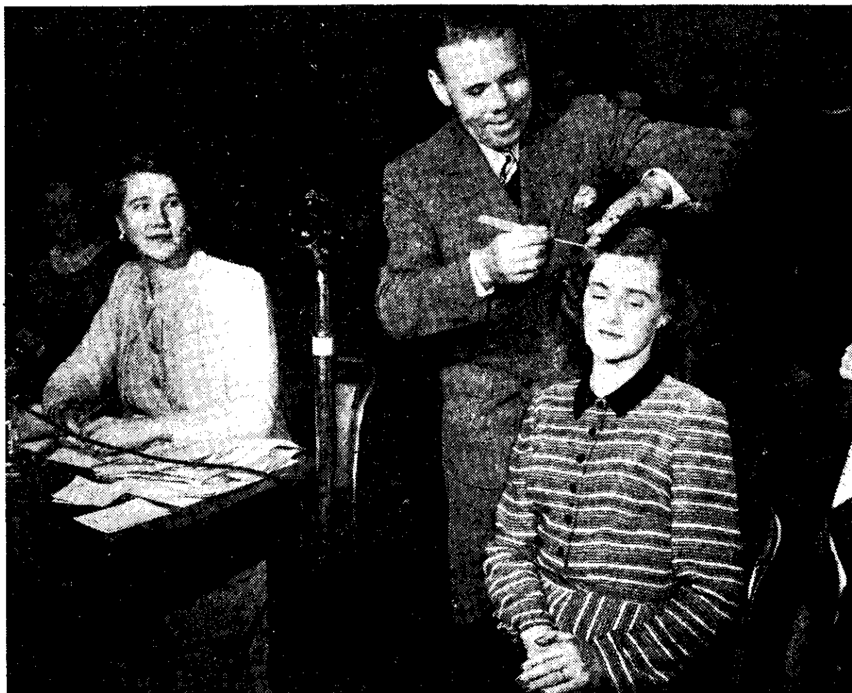
A demonstration of hairdressing in 4ZB's Radio Theatre—one of the features in a recent "Women's Hour" programme