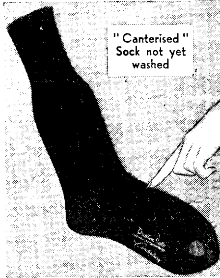
"Canterised" Sock not yet washed

You'll find Canterbury Socks in this Stand on your Store's counter.