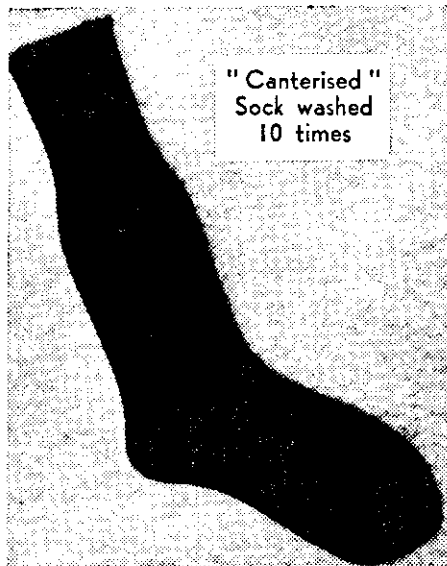
"Canterised" Sock washed 10 times