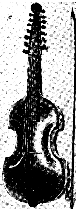
THE VIOLA D'AMORE, showing the characteristic viol shoulders, and the outward-curved bow