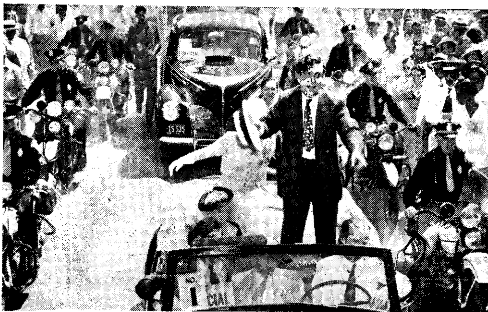
"Party conventions . . . one of the most colourful shows in American politics"

You must visualise a convention not only as an assembly to choose party can-