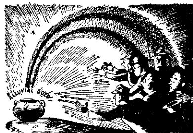
"The State lotteries of Australia are a nearer solace"

If, therefore, New Zealand is so regulated and complacent that her sons leave home, if she lacks feeling or expression to match her exquisite scenery, let us consider the positive contribution she has made to the world in a hundred years. First, I think we should rate the example of living in charity with a native people, who on