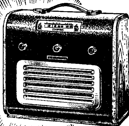
MODEL 402 6 VALVE AC/BATTERY DUAL PURPOSE PORTABLE £36 0 0 INCLUDING BATTERIES

UNCONDITIONALLY GUARANTEED FOR 12 MONTHS THROUGHOUT NEW ZEALAND