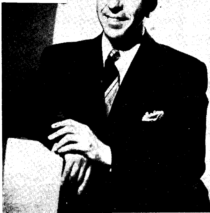
MANTOVANI, who, with his orchestra, takes part in "The Noel Coward Programme" now being heard from 2ZB and 4ZB. The programme, which will start at the other Commercial stations in August, consists of 13 half-hour episodes of popular Coward melodies and stories behind their composition