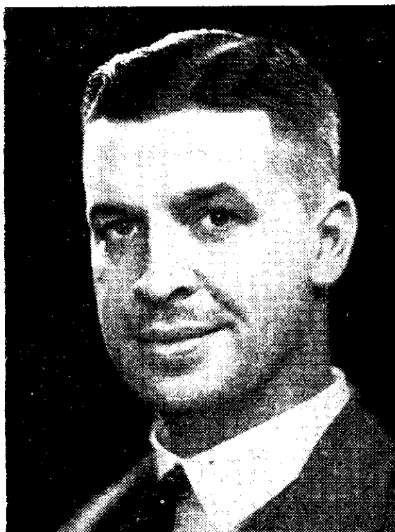
SIR JOSEPH WARD, who will speak in the UN Children's Appeal from 3ZB at 2.30 p.m. on Tuesday, May 25