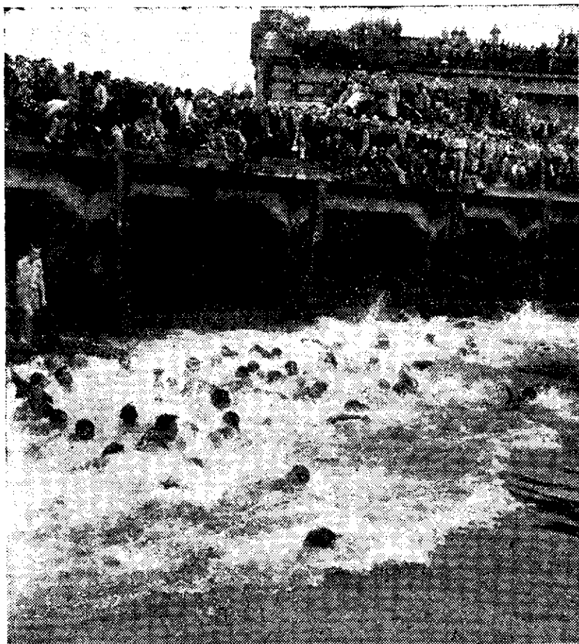
WELL AWAY, to the amusement of a packed grandstand, and it's anyone's race. Half of Auckland was there, perched precariously on the wharf-edge, but there were no involuntary participants