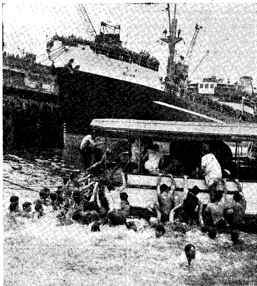
PHOTO FINISH—and what a photo! Everyone is all wet, but on a typically damp Auckland day, who cares anyway?