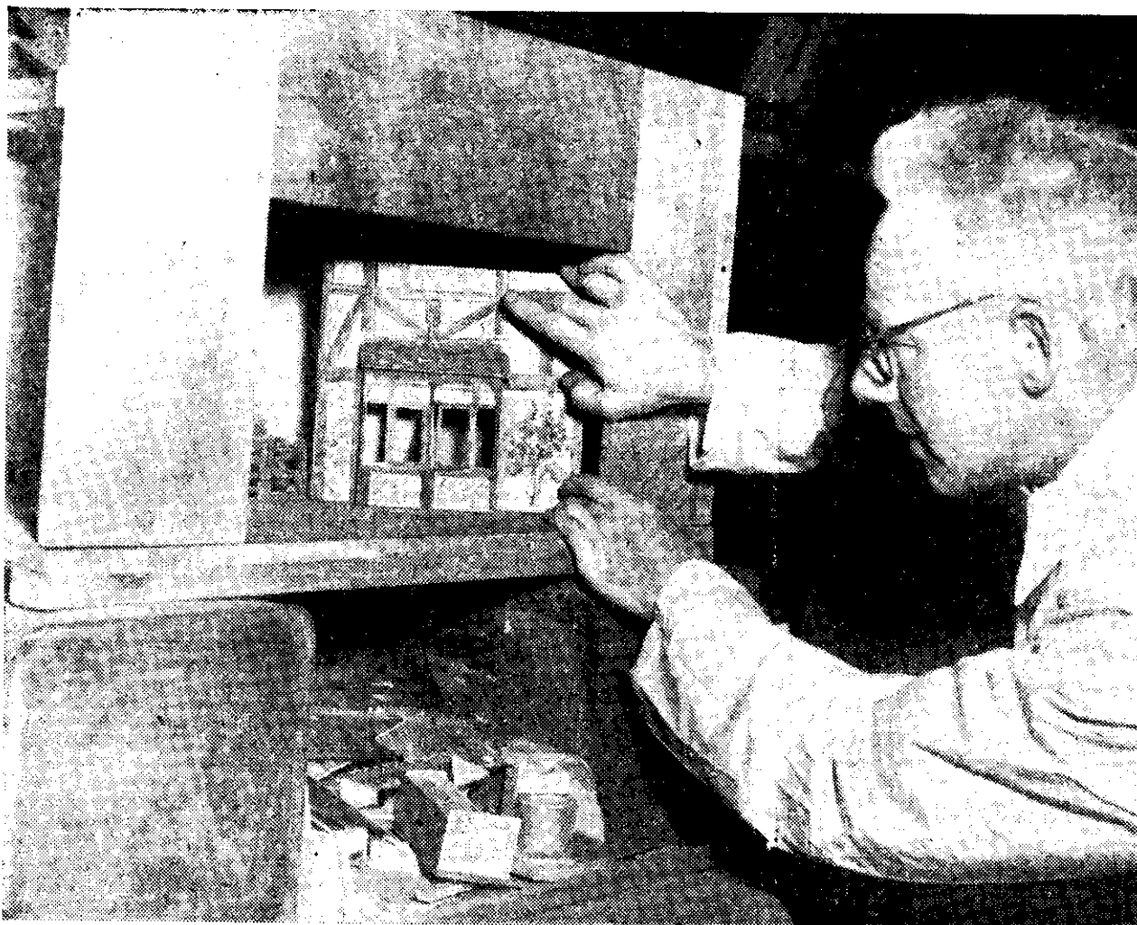
BEFORE full-scale scene-painting begins, model stage sets (to the scale of half-an-inch to the foot) must be made and set up according to the stage plan