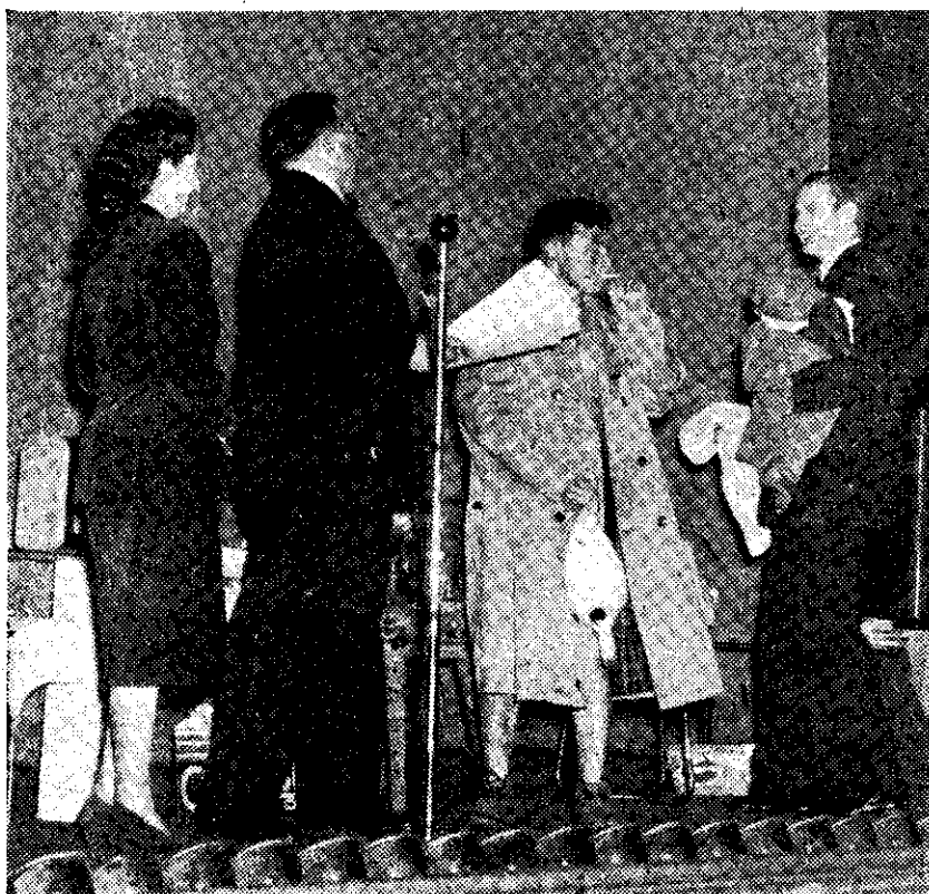
THE PENALTIES were taken in good part—this competitor had to dive into the Municipal Baths and retrieve a large flounder.

Next day Posers, Penalties and Profits was table talk all over New Zealand. The Listener has been told by the Commercial Division of the NZBS that applications for the remaining shows have reached such figures that the lists have to be closed. The quiz has yet to be presented at the Majestic Theatre, Wellington, on Thursday, May 13, and the Regent Theatre, Palmerston North, on Thursday, May 20. It had already reached Christchurch when we went to press and it will make return trips to Dunedin on May 27; the Regent Theatre, Christchurch, on June 3; Majestic Theatre, Auckland, on June 10; and the Majestic Theatre, Wellington, on June 17. It will be recorded and broadcast by all the Commercial stations and 2ZA at 9 o'clock on each evening of performance.