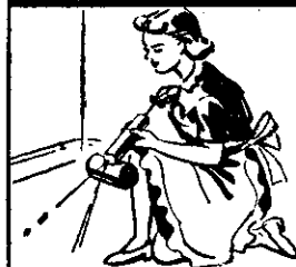
HOW TO CLEAN CARPETS