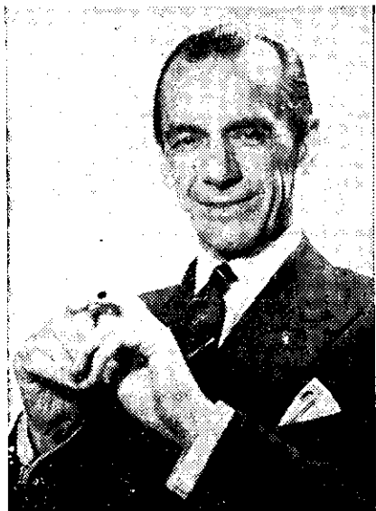
MALCOLM SARGENT