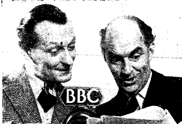
RICHARD MURDOCH and KENNETH HORNE, leading comedians in the BBC programme "Much-Binding-in-the-Marsh," which will start from 1YA on March 5, and 2YA and 3YA on March 6 (see page 4)