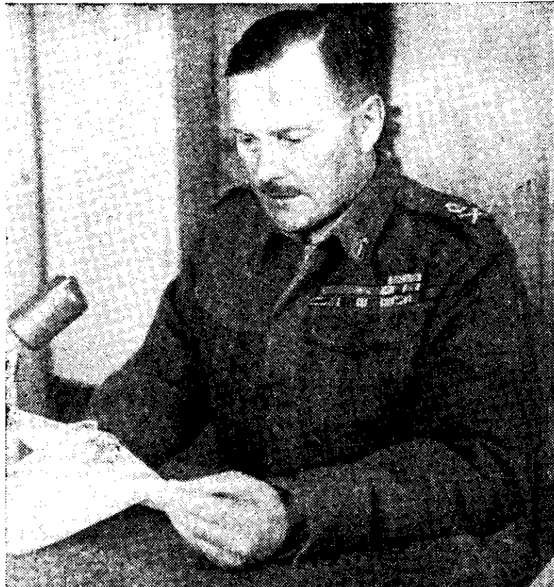
HIS EXCELLENCY the Governor-General, Sir Bernard Freyberg, V.C., who will broadcast a New Year message from the main National and Commercial stations at 7.0 p.m. on Wednesday, December 31