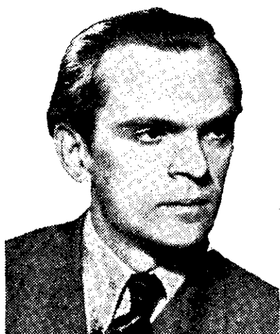
WITOLD MALCUZYŃSKI (pianist), who will be heard in a recorded programme from 3YA at 9.55 a.m. on Saturday, November 29