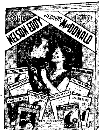
Nelson Eddy-Jeanette MacDonald

20/- SONG FOLIO 3/- — WORTH OF MUSIC FOR