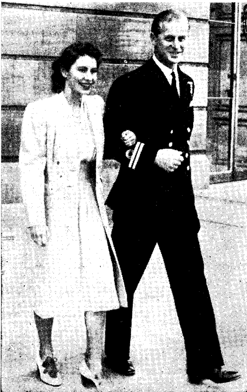
PRINCESS ELIZABETH AND LIEUTENANT MOUNTBATTEN. The world will be listening on November 20 (see page 6)