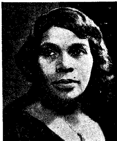
MARIAN ANDERSON Hotel Managers Have Prejudices.

It is true that I arrived in America knowing more about the Negro question than about keeping house, more