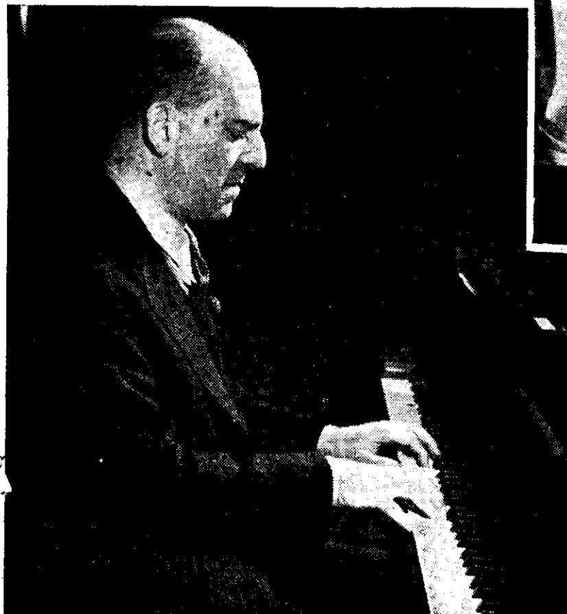
SOLOMON (pianist), who will play Beethoven's Concerto No. 3 in C Minor from 3ZR at 9.28 p.m. on Monday, September 15