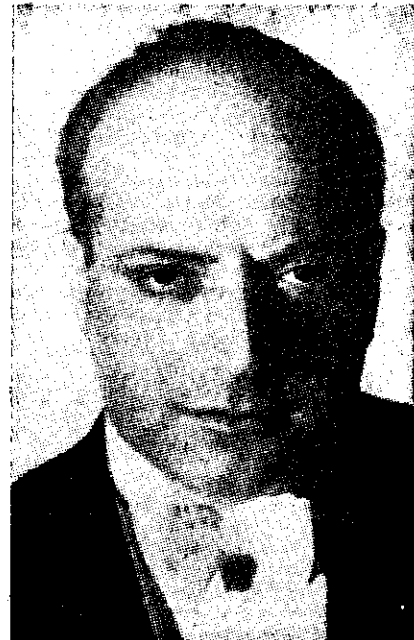
SIMON BARERE Rachmaninoff's piano will come too

For his coming tour, Barere will use Rachmaninoff's CD-15 piano, of which there are only 20 copies in existence, and at which the great composer wrote some of his later music.