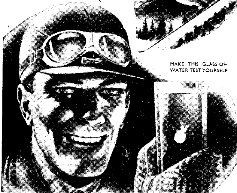
MAKE THIS GLASS-OF-WATER TEST YOURSELF

Within two seconds after starting down the inrun, expert jumpers have hit the amazing speed of 60 m.p.h. on their skis . . .