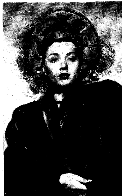
Three of the people who will be heard in special program THIS Sunday, April 27: Above, LANA TURNER (left), of M Century-Fox, who will convey greetings from Hollywood (2ZB's official accompanist), who will play "I