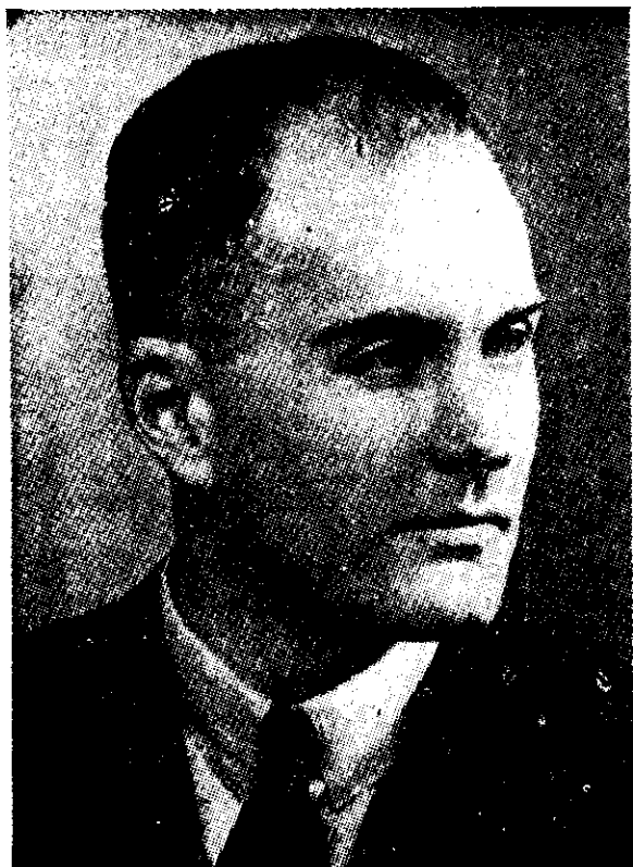
BOYD NEEL He chose boldly