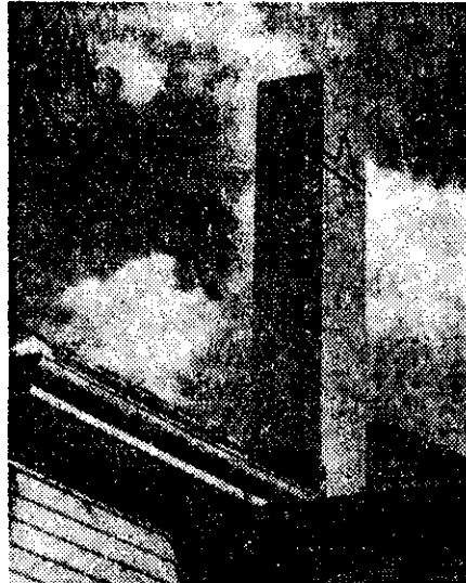
Photographs showing how easy it is to erect a B & B Concrete chimney.

ZANN treatment gives wonderful relief from piles. Safe to use and easy to apply. Treat yourself at home. Trial treatment for 9d. stamps. Zann Pty. Dept. Box 952, (B. M. Appleton, 21 Grey St.), Wellington.