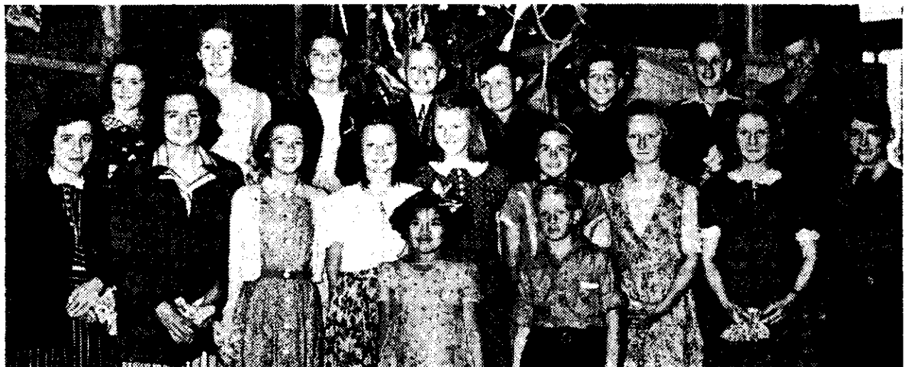
Members of the JUNIOR RED CROSS who took part in a Christmas musical programme from 2YA. They represented Switzerland, Canada, China, France, Greece, Norway, Poland, Sweden and the United States and some of them spoke briefly of Christmas in their homelands.