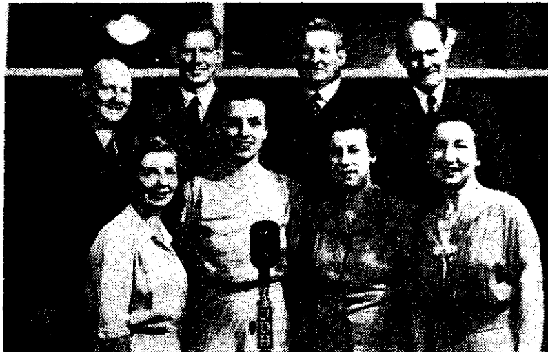
TWENTIETH CENTURY HITS IN CHORUS is a programme heard on Mondays at 6.0 p.m. from 1ZB and 3ZB. Here are the singers who take part