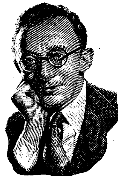
CLIFFORD CURZON —a reproduction of a recent drawing. He will be the pianist in a recording of Falla's "Nights in the Gardens of Spain" from 3YL at 8.0 p.m. on Saturday, November 9