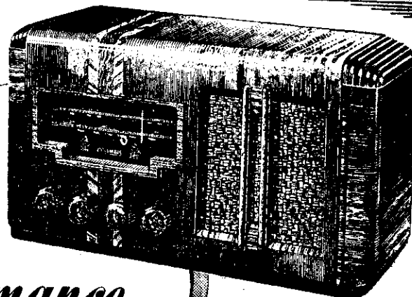
Model 66 "Warrior"—£35-0-0 Height: 12"; Width: 22"; Depth: 9".

Model 66, incorporating a sixth valve in a stage of radio-frequency amplification, is a radio built to combine powerful performance and high quality of tone whilst still remaining in the medium price field. It is the radio par excellence for the listener whose sporting, musical or general interest ranges widely over the various events which are broadcast from New Zealand—Australian or world shortwave stations.