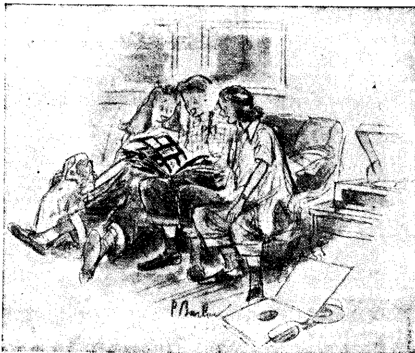
"Who knows—our own clothes will probably look just as silly 20 years from now"