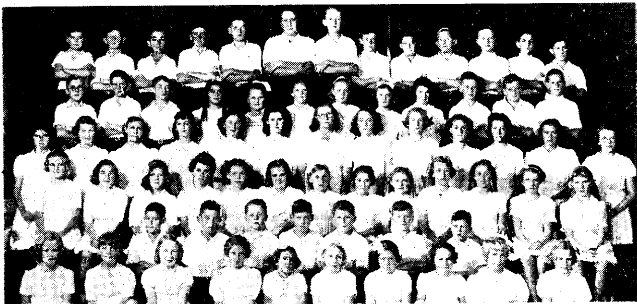
Members of Uncle Tom's Children's Choir heard from 1ZB on Sunday mornings. The choir recently travelled to Wellington to give concerts