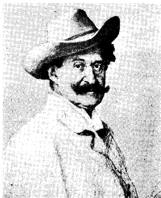
This is a BBC reproduction of a drawing of JOHANN STRAUSS. Music from his operettas will be heard from 3YL on Wednesday evening, August 14