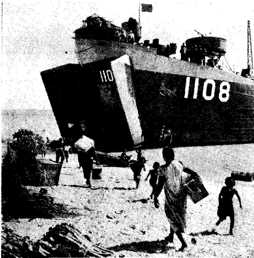
NATIVES of Bikini carry their possessions aboard the LST which transported them to Rongerik