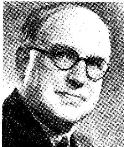
ANDERSEN TYRER

"Following the success achieved by the Centennial Orchestra established by the Government as a central feature of the centennial music celebrations in 1940, it was resolved that when conditions were favourable the permanent establishment of a national symphony