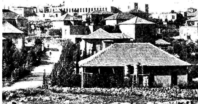
"THEY'VE planned and they've achieved more than any other colonists in the history of the world." The new Jewish garden town, Beth Hakerim