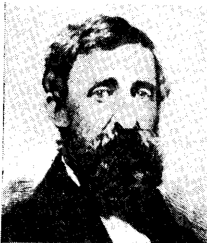
H. D. THOREAU

"Timaru in Canterbury Province of the South Island of New Zealand is a little red-roofed city close to the bluffs and the sea, and not far from Christchurch, the university centre. I flew over it in June, and if I remember