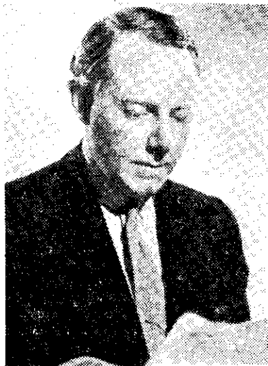
Maiden voyage

In 1945 he was appointed assistant general manager of the ABC, and was seconded for three months to the personal staff of the Governor-General, the Duke of Gloucester, as Press and Broadcasting Liaison Officer. His new job in London will enable him to keep in touch with the ABC and exchange programmes and techniques with it.