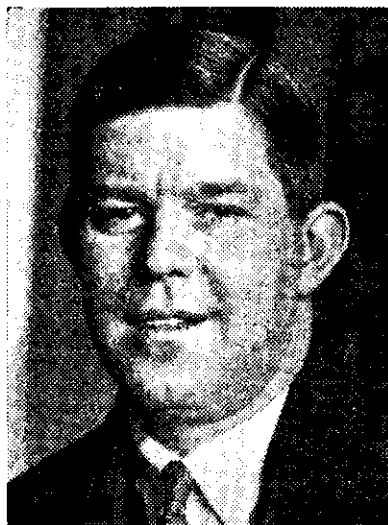
In 2YD's Sporting Life session on Monday evening, April 29, WALTER LIN-DRUM (above), the Australian billiards player, will be starred