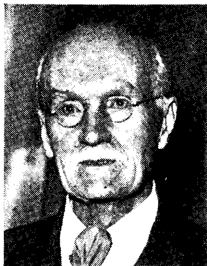
PROFESSOR GILBERT MURRAY , Greek scholar and former President of the League of Nations Union, who will be heard in the new BBC Brains Trust series from 2YC on Friday, May 3