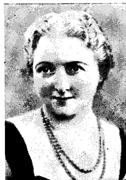
ISOBEL BAILLIE , well known to New Zealanders since she sang here at the Centennial music festival, will be the subject of 1YA's For My Lady session at 10.20 a.m. on Monday, April 29