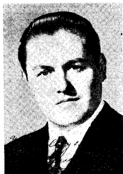
JUSSI BJORLING (tenor), who is heard often from all National Stations, is scheduled to sing in 12M's Sunday evening Fifteen-minute recitals on May 5