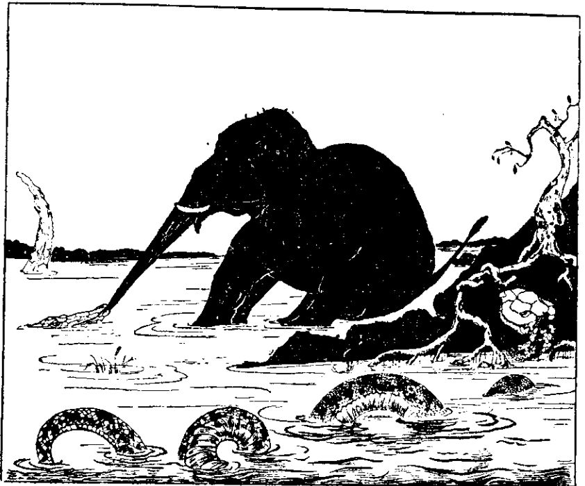
THE ELEPHANT'S CHILD, sketched in the very act of showing "How the Elephant Got His Trunk." The crocodile in the great grey-green greasy Limpopo river is doing the stretching, and the Bi-Coloured-Python-Rock-Snake is hurrying through the water to assist.

SOME of Rudyard Kipling's "Just So Stories" have been adapted for radio for the first time by the BBC, and recordings of them have now reached New Zealand. They will be broadcast first in the Children's Hour at 2YA on Saturdays, starting on March 23. On this page we reproduce, by special permission, Kipling's own illustrations to the first four stories in the series, "The Elephant's Child," "The Beginning of the Armadilloes," "The Crab that Played with the Sea" and "The Butterfly that Stamped." The fifth programme is based on "How the Leopard changed his Spots"; the sixth contains "How the Camel got his Hump" and "The Sing-Song of Old Man Kangaroo." Kipling wrote the "Just So Series" for his young son and daughter more than 40 years ago.