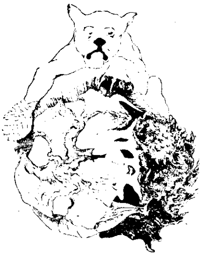
"THIS IS a picture of the whole story of the Jaguar and the Hedgehog and the Tortoise AND the Armadilloes all in a heap"

SOME of Rudyard Kipling's "Just So Stories" have been adapted for radio for the first time by the BBC, and recordings of them have now reached New Zealand. They will be broadcast first in the Children's Hour at 2YA on Saturdays, starting on March 23. On this page we reproduce, by special permission, Kipling's own illustrations to the first four stories in the series, "The Elephant's Child," "The Beginning of the Armadilloes," "The Crab that Played with the Sea" and "The Butterfly that Stamped." The fifth programme is based on "How the Leopard changed his Spots"; the sixth contains "How the Camel got his Hump" and "The Sing-Song of Old Man Kangaroo." Kipling wrote the "Just So Series" for his young son and daughter more than 40 years ago.