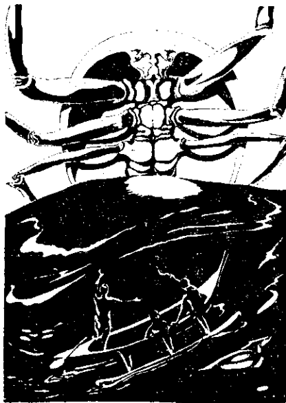
PAU AMMA, the Crab, rising out of the sea as tall as the smoke of three volcanoes