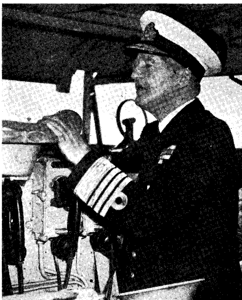
ADMIRAL LORD FRASER who, as Commander-in-Chief, Home Fleet, directed the operations which led to the destruction of the German battle-cruiser Scharnhorst in 1943. The story of the action is told in the session "Achievement," from 3ZR on March 18, at 8.15 p.m.