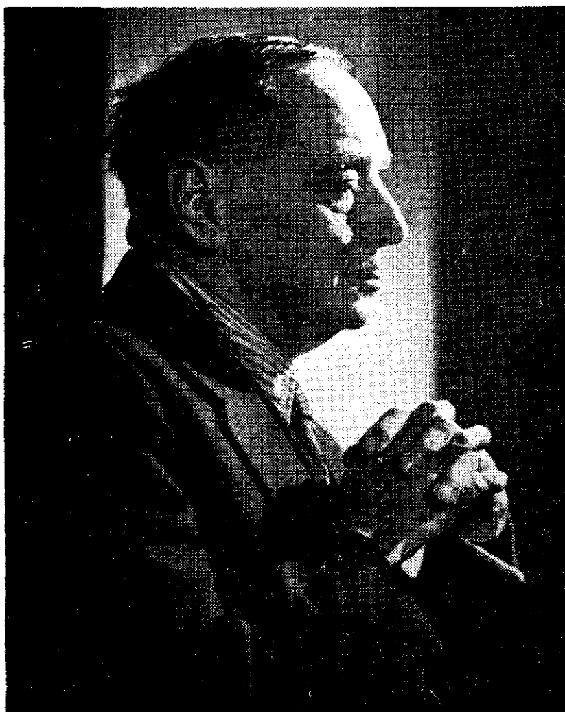
H. G. WELLS, novelist, social historian and seer, whose "Kipps" is the subject of the BBC "Have You Read?" session to be broadcast by 2YA, at 4.30 p.m. on March 24