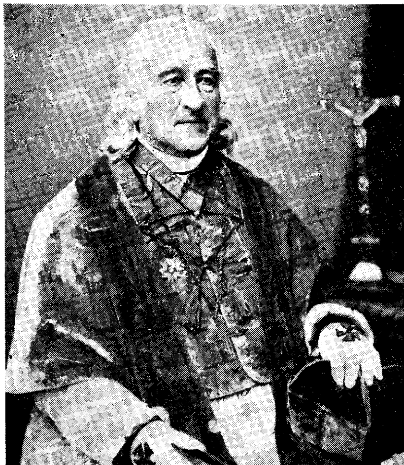
Below: BISHOP POMPALLIER, who is commemorated in 4ZB's "Famous New Zealanders" session on March 13, at 7.0 p.m.