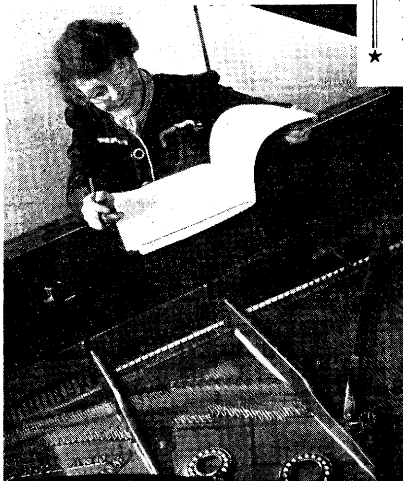
Above: MARGARET SUTHERLAND, the Australian composer, whose Two Choral Preludes on Bach Chorales will be heard from 2YN this Saturday, March 9, at 8.10 p.m.