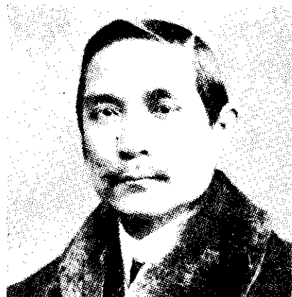
SUN YAT SEN, whose story is told in the session "Achievement," from 3YL on March 10, at 8.15 p.m.