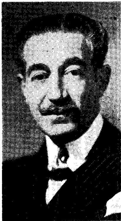
Above: The sophisticated MICHAEL ARLEN. His play "Irreproachable Conduct" is going the rounds of the National stations and will be heard from 3ZR at 8.16 p.m. on March 7