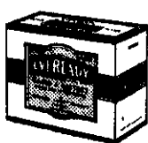
No. X250 High Capacity Radio 'A' Battery