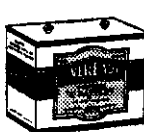
No. 741 Portable Radio 'A' Battery