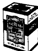
No. 762 Portable Radio 'B' Battery