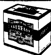
No. 770 Large Size Radio 'B' Battery