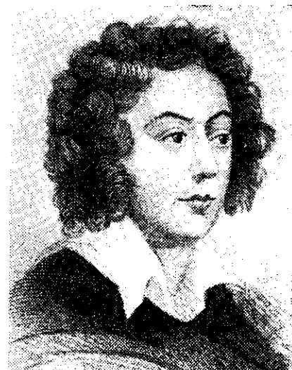
HENRY PURCELL : Wednesday, November 21 will be the 250th anniversary of his death, and some of his music will be broadcast on the following evening (which is St. Cecilia's Day) by 2YA. (See paragraph, page 4.)