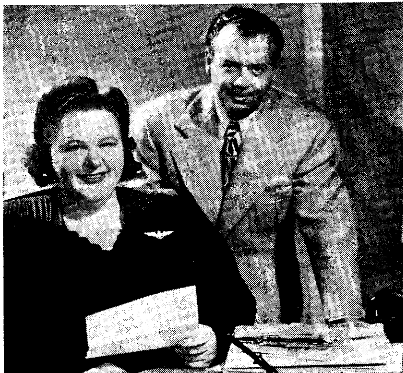
The very popular Kate Smith Show personalities, KATE SMITH and TED COLLINS, heard often in U.S.A. programmes