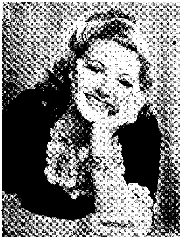
ANNE SHELTON will be heard in her cheerful BBC programme "Anne to You" from 4YA on Friday, September 14, at 2.30 p.m., and also from 3ZR on September 10, at 8.30 p.m.