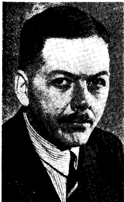
VICTOR HELY-HUTCHINSON, the BBC's Director of Music, whose "Overture to a Pantomime" will be heard in the programme "Music from Britain," from 2YH, Napier, at 8.0 p.m. on Wednesday, September 12. (See paragraph, page 4)